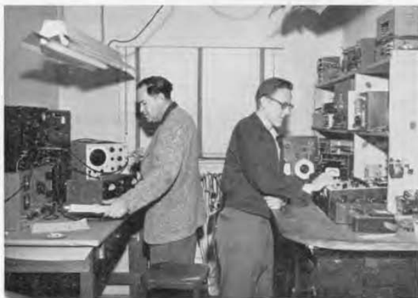
View of the modern, well-equipped laboratory at Western Instrument Company.