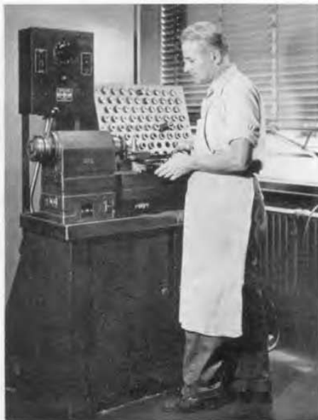
Figure 2. Typical installations of the \frac{3}{4} -hp Variac Speed Control, (left) on a lathe, and (right) on a toroidal winder.