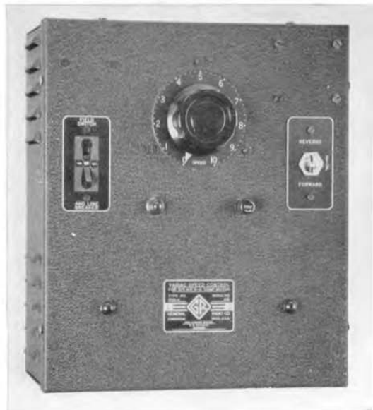
Figure 1. Panel view of the Type 1702-A 3/4-hp Variac Speed Control.

third horsepower rating of the TYPE 1700-B Variac Speed Control is insufficient for this duty, although it has proved ample for many special applications such as toroidal winding machines, resistance-card-winding machines, and for lathes used in finishing small parts. It has been apparent that a unit of about three-quarter horsepower rating